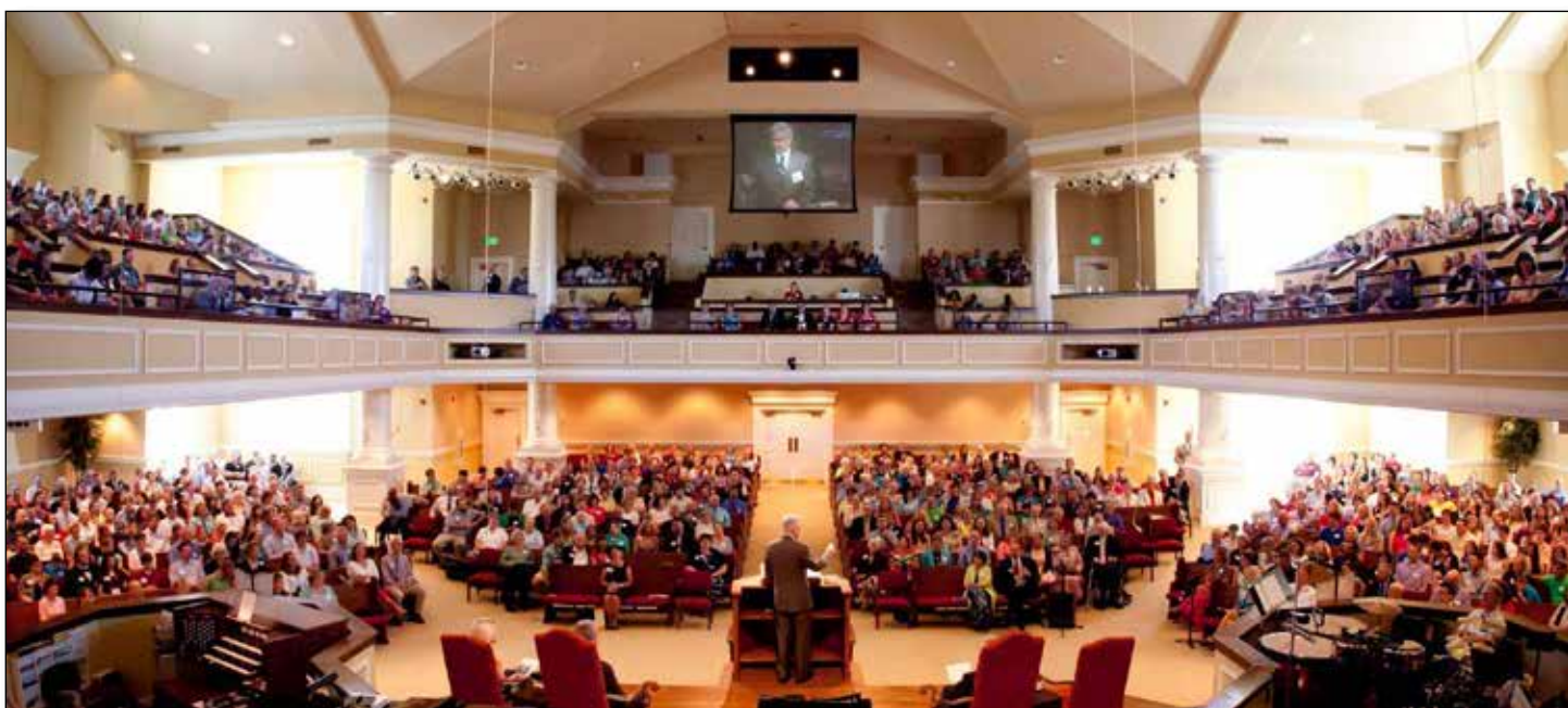
Oakmont's Sanctuary: Oakmont members and friends gathered together in 2014 to celebrate 50 years of mission and ministry to the Greenville community and beyond.

As Oakmont moves into a new era, our focus remains on the vision created by those 42 faithful charter members. In faith, they stepped out to follow God's Oakmont Idea. We have journeyed through some difficult and challenging times amid a global pandemic. However, we see God at work in our church, community, and world, and we want to continue being a part of that work. God's Oakmont Idea is alive and well.