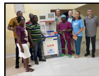
Staff at Mercy receiving new anesthesia machine from Healey International

Another exciting thing happening at Mercy is the construction for the home of a mobile vaccine manufacturing laboratory! This mobile lab will be taken to wherever a malaria outbreak takes place, thereby saving time and money while saving even more lives.