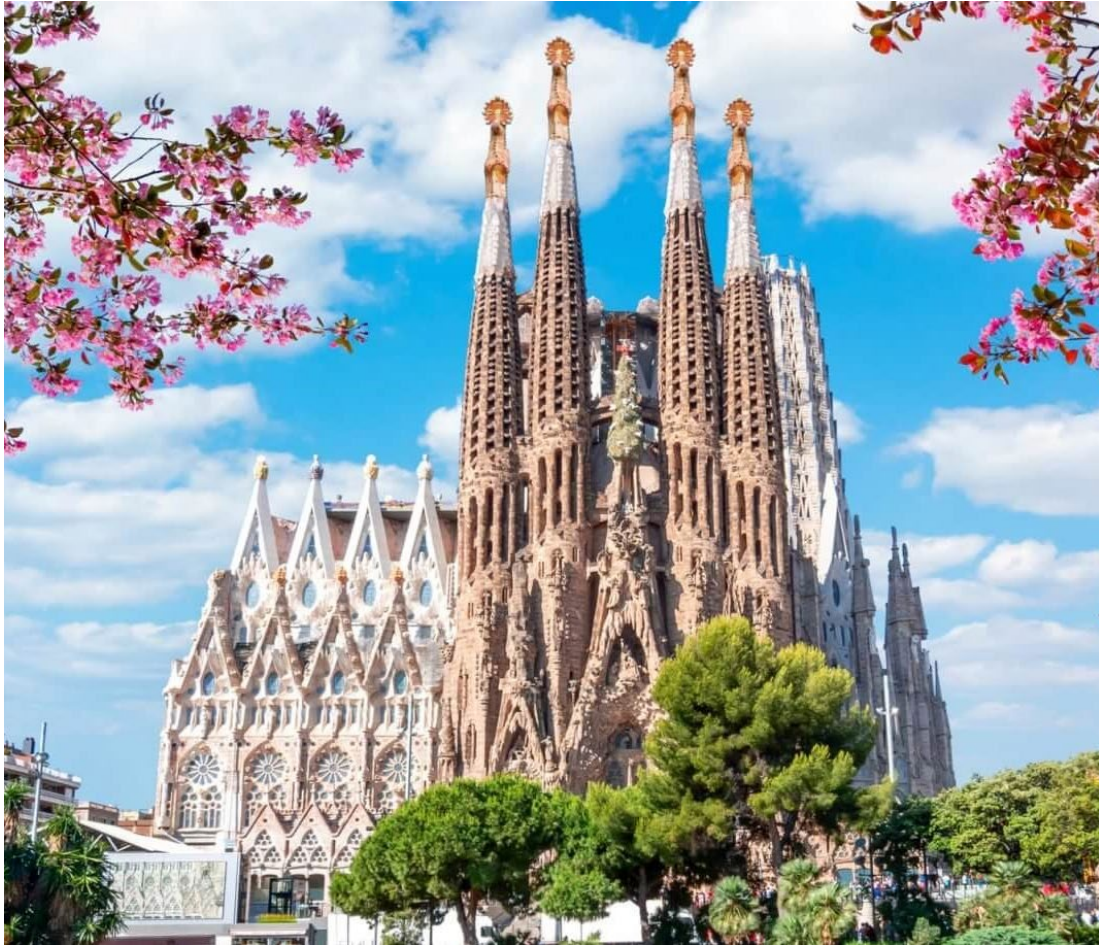
Basílica de la Sagrada Família