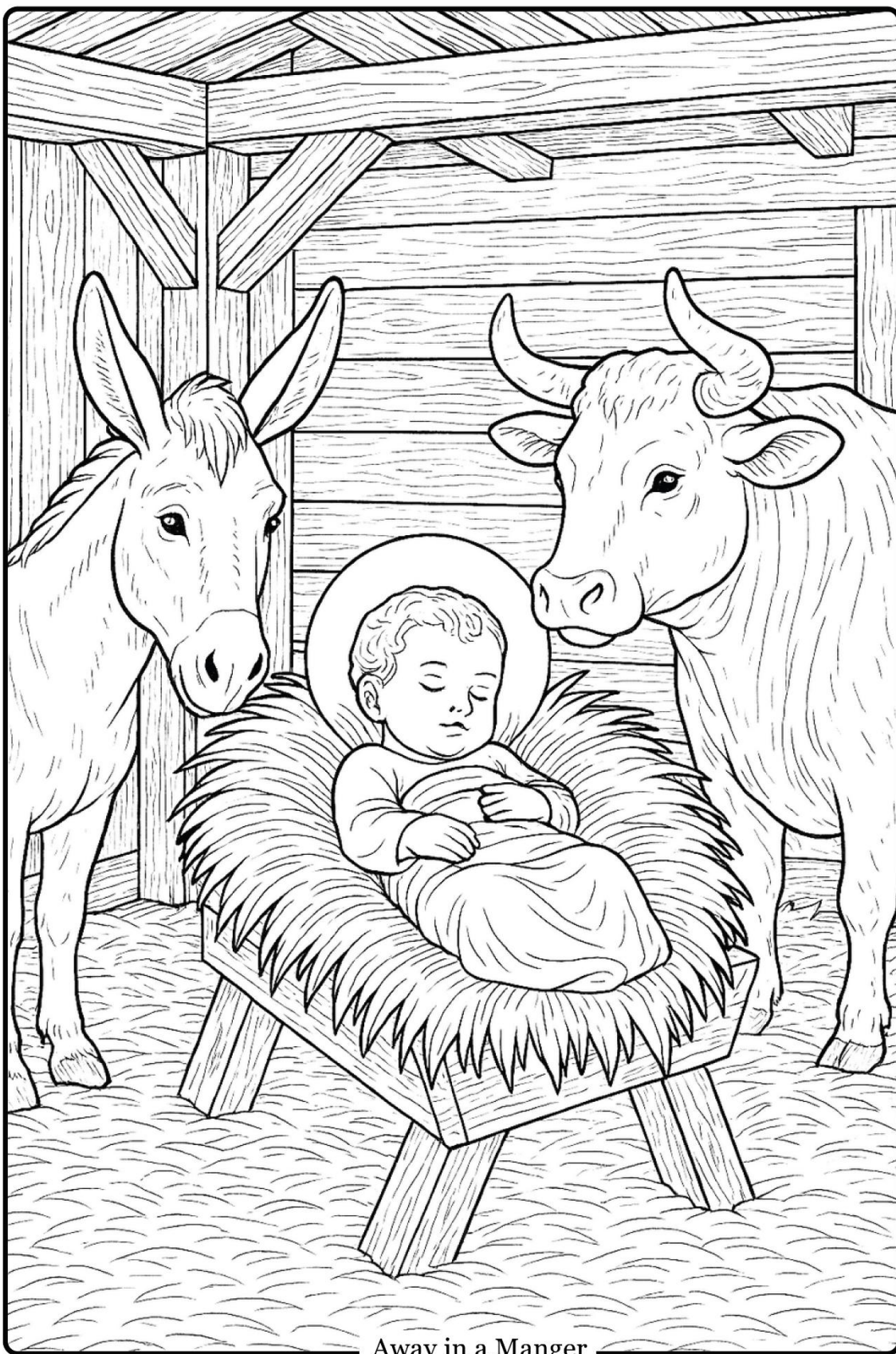
Away in a Manger