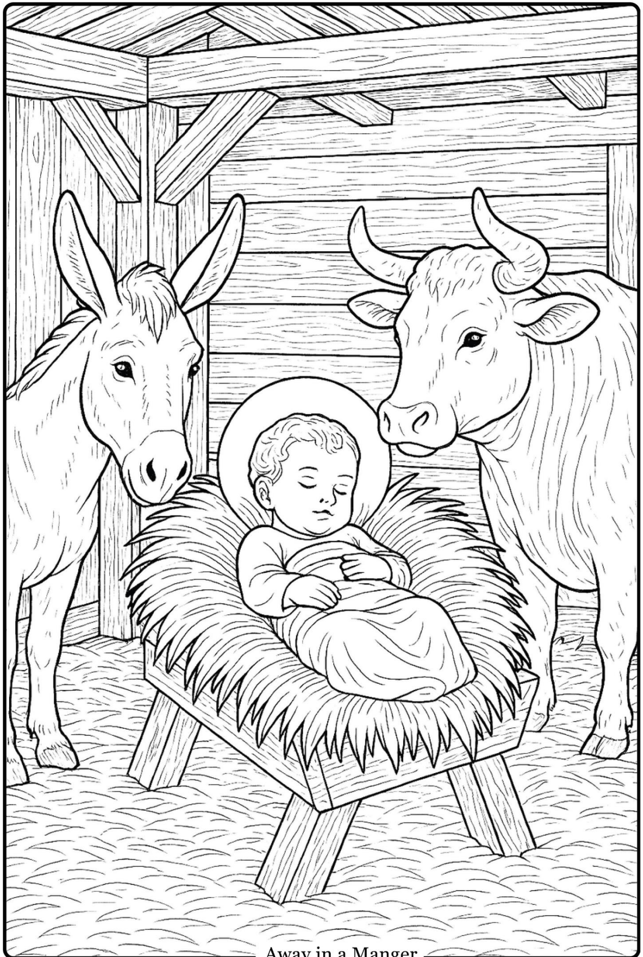
Away in a Manger