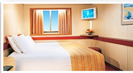
OCEANVIEW FROM $560