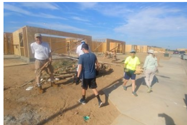
Summer Mission Trips

The people of Faith also support and serve in partnership with programs for alleviating hunger, addressing homelessness, and educating youth—all right here in Sacramento. With many opportunities to serve, we as the Body of Christ are able to carry out Kingdom work that both glorifies God and cares for others. Won't you join us?