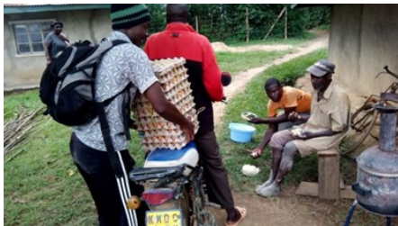
One Child One Hen