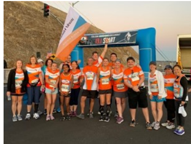
Team World Vision