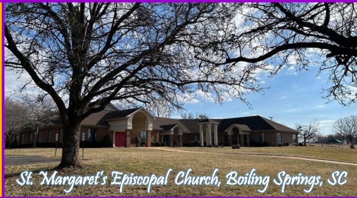
St. Margaret's Episcopal Church, Boiling Springs, SC

9:30-10:10 Adult Formation Every 2nd & 4th Sunday - Youth C.F. 10:30 AM Holy Eucharist Rite 2 Year A & Children's Church Live-streamed on Facebook, YouTube