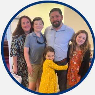
The Bowen Family