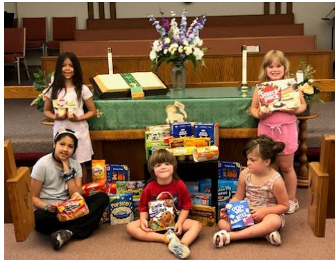
Food and funds were delivered to Gumdrops on July 17.