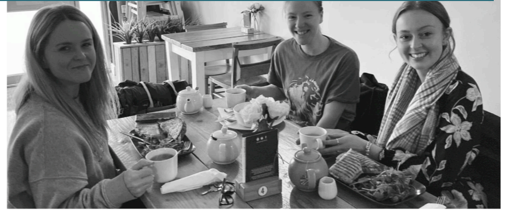
INFUSION COFFEE HOUSE & COMMUNITY SPACE PENNY DAY