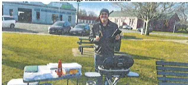
Manning The Portable BBQ For Another Outreach In Gore