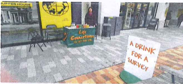
Survey Evangelism Set Up & Outreach In Invercargill

So we changed tact, and implemented an historical approach of using survey evangelism which has been successful in the past.