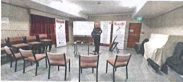
Despite A Great Effort Of Out Reach, We Had Zero Turn Up At Mataura.