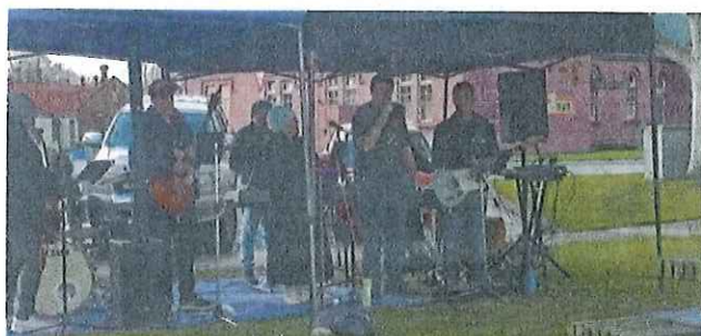
Yours's Truly Sharing the Gospel At A Public Outreach in Gore