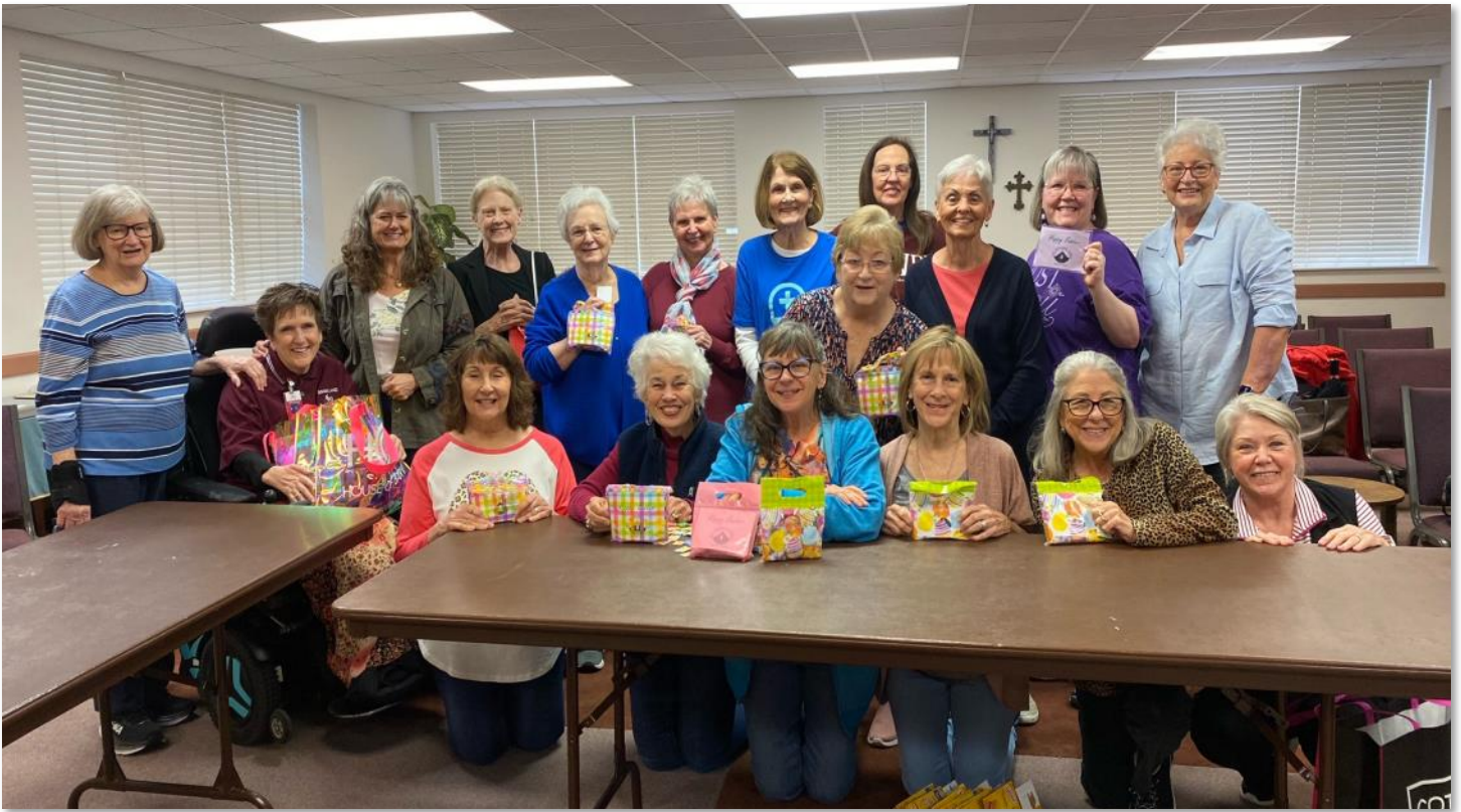
The Amazing Grace Bible Study made Easter gift bags for Crestview Affordable Housing.