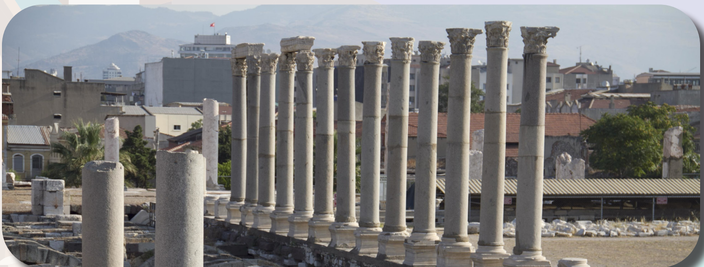
A view across the agora ruins at Smyrna to the columns of the Western Stoa—a covered public walkway in ancient times.

Revelation 2:11 - Jeremiah 2:2, Matthew 23:23, Matthew 24:12