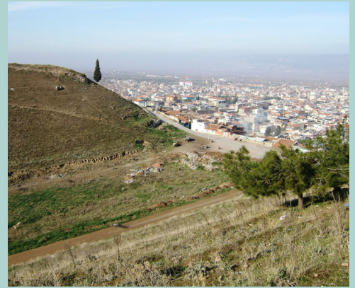
Remains of the stadium built into the acropolis at Philadelphia.