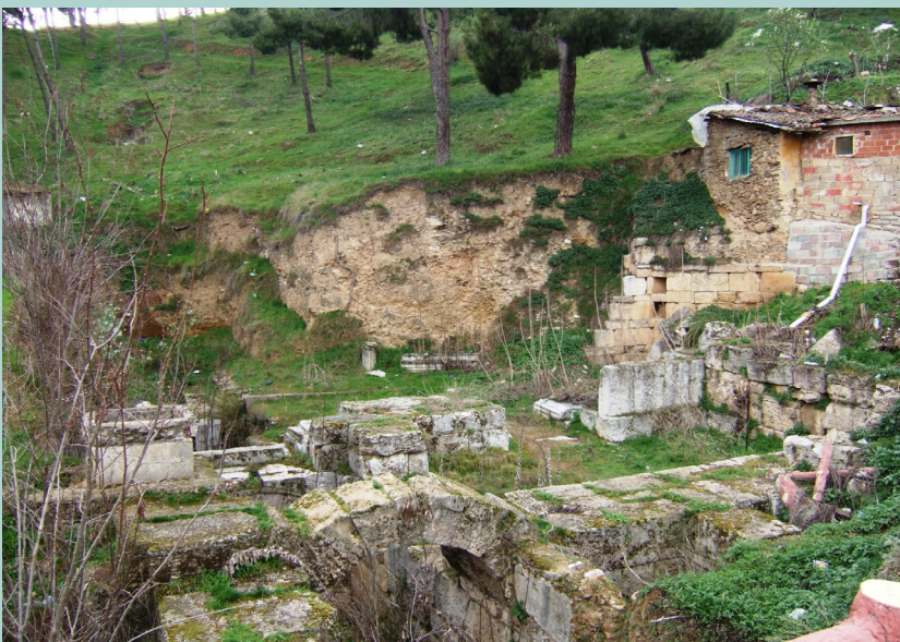
Theater remains at Philadelphia. The theater's stage building foundations are all that remain.

2. Verse 10 says, “Because you have kept my word about patient endurance, I will keep you from the hour of trial that is coming on the whole world, to try those who dwell on the earth.” Is this a promise for us too? Has the Lord kept you from any trials? If so, what? If not, why not?