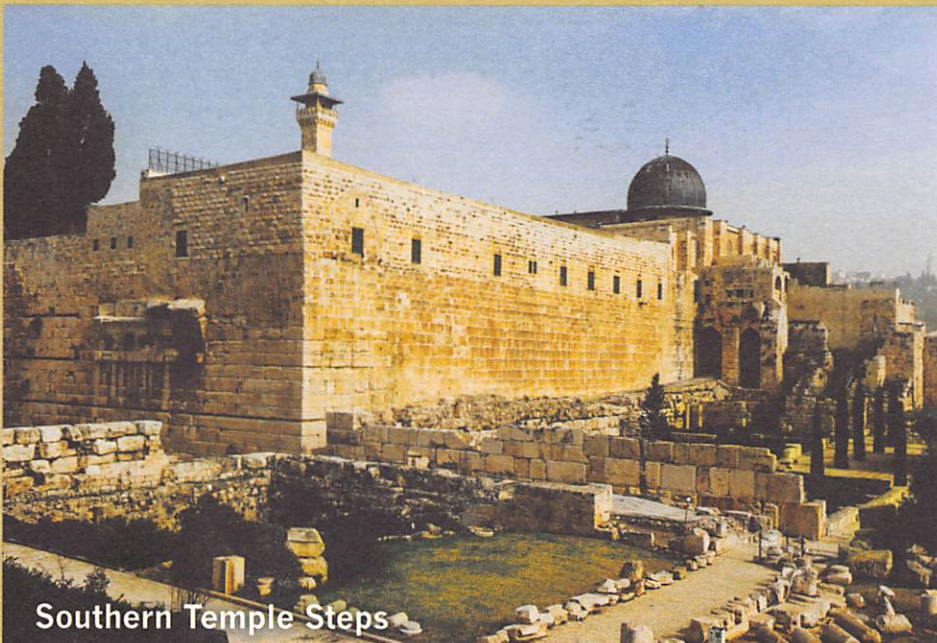
Southern Temple Steps

Scheduled International Flights • Top Quality Four Star Hotels • Israeli Buffet Breakfast & Dinner Daily • Top Guide with In-Depth Knowledge of the Old and New Testaments • Private Air Conditioned Motorcoach • Visits to the Major Historical Sites • Boat Ride on the Sea of Galilee • Certificate of Your Pilgrimage to ISRAEL .....and more!