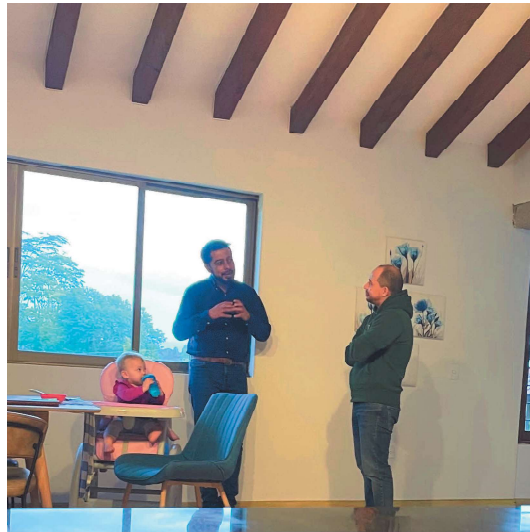
Strategic Planning and Praying