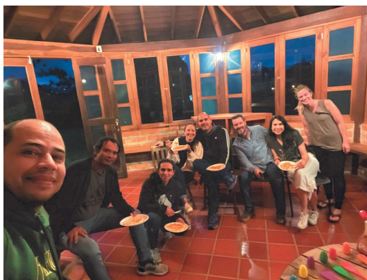
Small Group Leaders Training