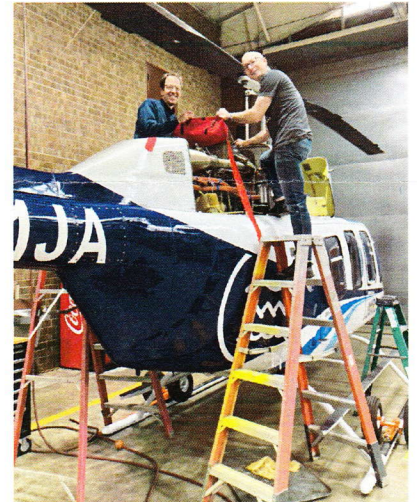
Our new, turbo Bell L4 LongRanger Helicopter

Next, we were trusting God for another seemingly impossible task—expanding the JAARS fleet by adding aircraft. This would allow us to reposition our fleet and enable us to send aircraft to the new fields when the time comes. Our leadership determined that, along with several additional aircraft, JAARS should acquire a turbine helicopter and a Cessna Caravan. Just these two aircraft alone could cost millions, and JAARS had no idea how God would meet this need. But our God is truly Jehovah Jireh, our provider!