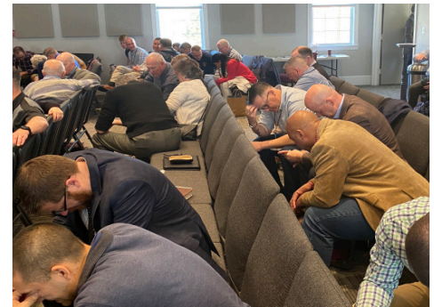
AGC Chaplains and their families praying for all AGC Minsitries, their Nation (its leaders) and all AGC Families