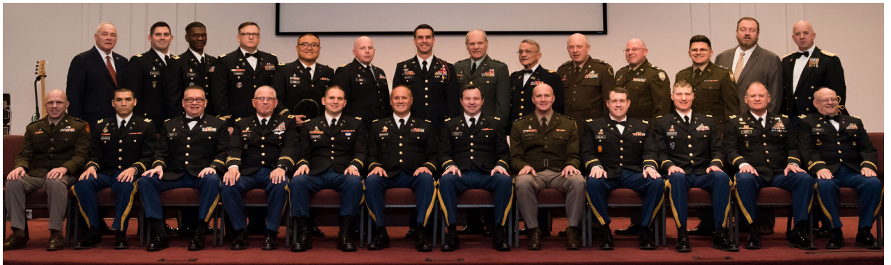
-----> AGC Army Chaplains (Active Duty, Reserve, National Guard, and Retired)