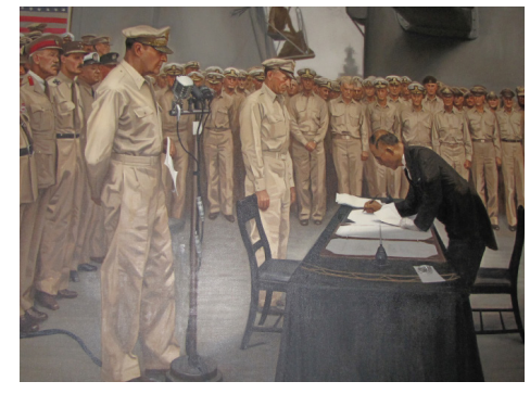
AGC Chaplains during a team-building period visited the MacArthur Museum in downtown Norfolk, VA