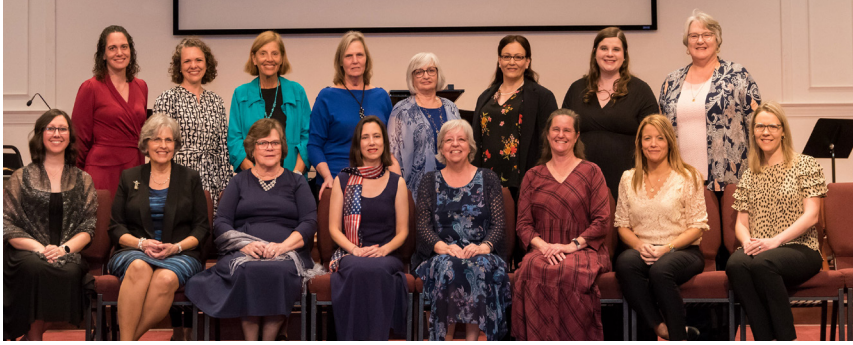
<---AGC is profoundly grateful for the faithful & sacrificial support of our wives; Ladies, we honor you and thank God for you!