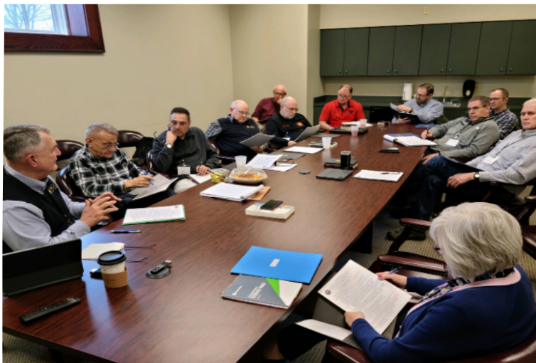
(<=== Left) The AGC Board met in person and via Zoom on Monday, 20 February, 2023 for the Annual AGC Board Meeting in the Virginia Beach Theological Seminary Board Room located in the Seminary Building