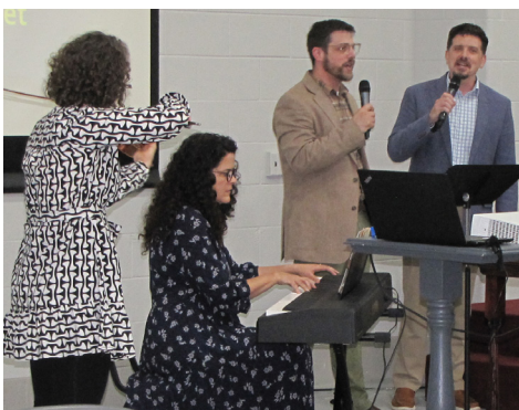
<--- Special Music The Word is Alive! - provided by CBC Staff and Volunteers