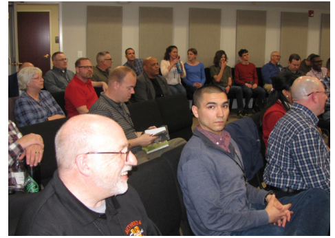
AGC Chaplains and Wives met in the Virginia Beach Theological Seminary Chapel for our First Session on Monday