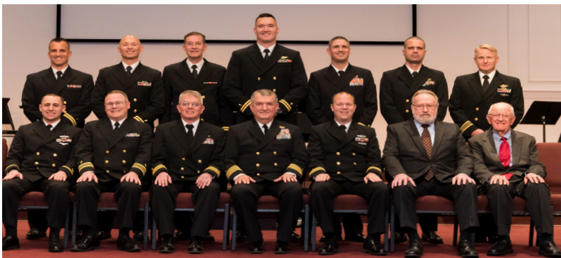
<---AGC USN Chaplains and AGC---> USAF and CAP Chaplains