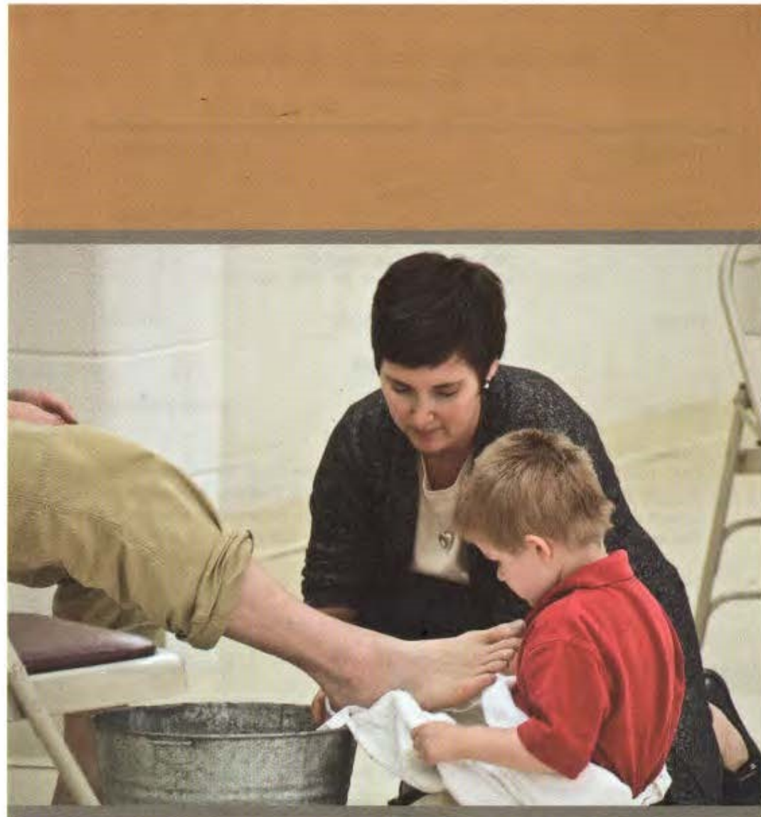
03-29-18, Maundy Thursday/ Love Feast. Printed in the USA

Text for today: "For I received from the Lord what I also handed on to you, that the Lord Jesus on the night when he was betrayed took a loaf of bread, and when he had given thanks, he broke it and said, 'This is my body that is for you. Do this in remembrance of me .'" (1 Cor. 11:23-24, NRSV ). Bible readings for today: Exodus 12:1-4, (5-10), 11-14; Psalm 116:1-2, 12-19; 1 Corinthians 11:23-26 (24); John 13:1-17, 31b-35.