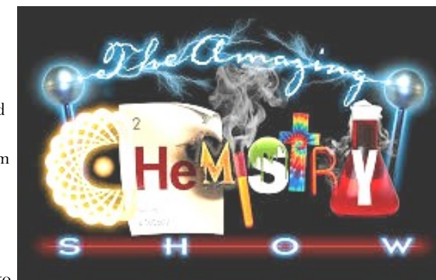
The Amazing Chemistry Show Coming Wednesday, April 25 at 6:00 pm