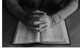
FEED into maturity