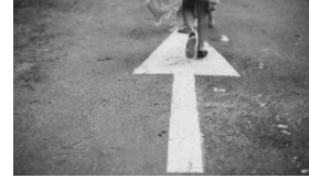
FORWARD into His mission