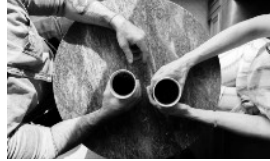
FOLD into God's family