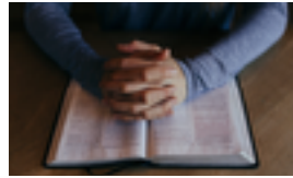
FEED into maturity