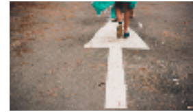
FORWARD into His mission