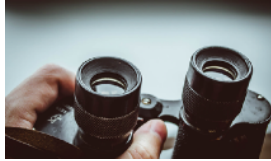
FIND undisciplined people