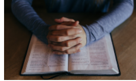
FEED into maturity