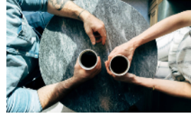
FOLD into God's family