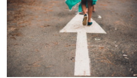
FORWARD into His mission