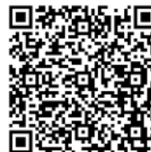
Scan to Give

As an act of worship and gratitude to God, we encourage you to give faithfully as the Lord leads. You may give by scanning the QR code, visiting our website, or using the offering boxes located in the Worship Center and foyer.