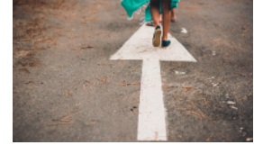
FORWARD into His mission