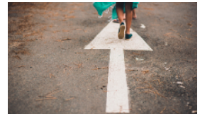
FORWARD into His mission