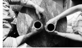
FOLD into God's family