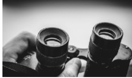
FIND undisciplined people