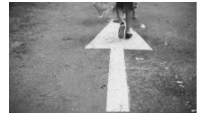
FORWARD into His mission