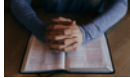
FEED into maturity