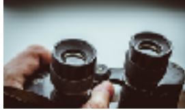
FIND undisciplined people