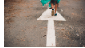
FORWARD into His mission