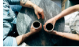
FOLD into God's family