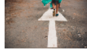
FORWARD into His mission