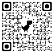
Scan For VBS Wishlist

We want to encourage you to worship God with your finances. If you wish to give an offering, you can scan the QR code, or use the offering boxes in the back of the Worship Center or in the Foyer.