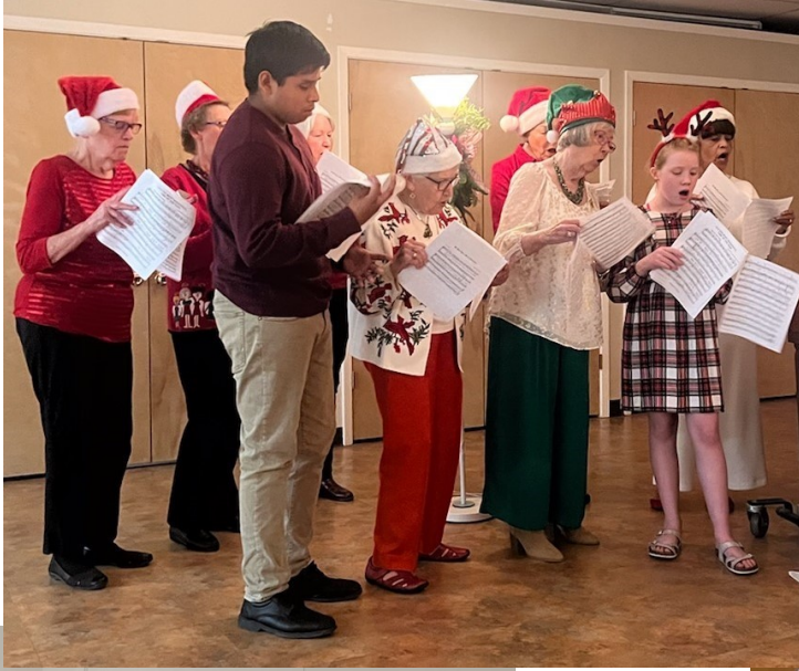
Entertainment was provided by the Whoville Singers, led by the Grinch himself!