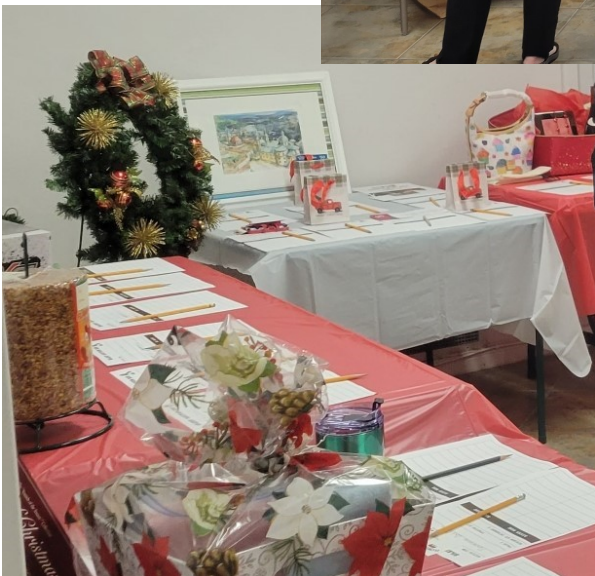
Our first silent auction, directed by the Head Elf herself, brought in over $2000!