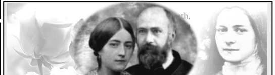
Saints Louis & Zelig Martin Parents of St Thérèse of Lisieux