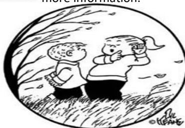
"If you listen real carefully when the breeze blows, you can hear God whispering."