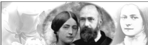
Saints Louis & Zelie Martin