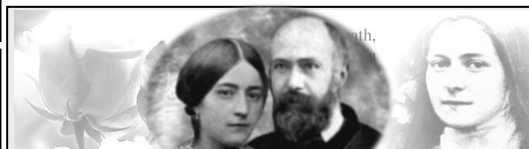
Saints Louis & Zelie Martin Parents of St Thérèse of Lisieux