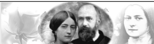
Saints Louis & Zelie Martin Parents of St Thérèse of Lisieux