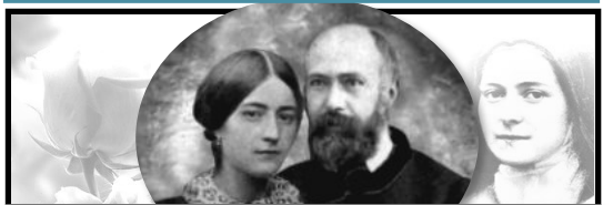
Saints Louis & Zélie Martin Parents of St Thérèse of Lisieux