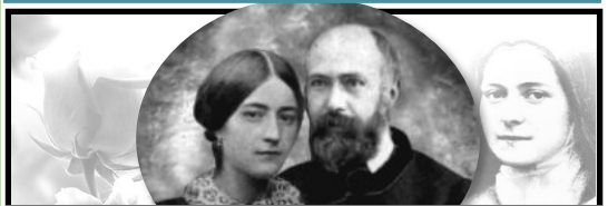
Saints Louis & Zélie Martin Parents of St Thérèse of Lisieux