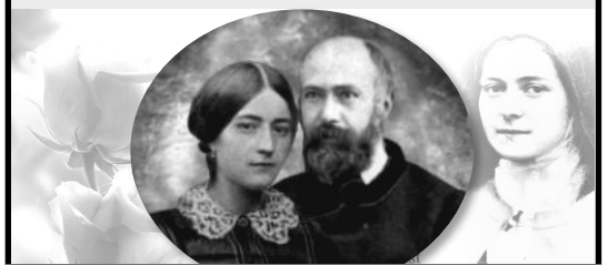
Saints Louis & Zélie Martin Parents of St Thérèse of Lisieux