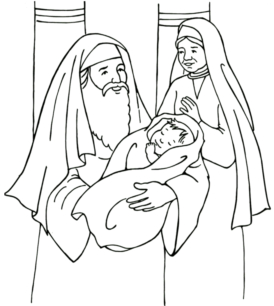
Simeon and Anna Thank God Luke 2

From Thru-the-Bible Coloring Pages for Ages 4-8. © Standard Publishing. Used by permission. Reproducible Coloring Books may be purchased from Standard Publishing, www.standardpub.com , 1-800-543-1301.