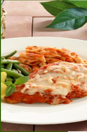
Try our Chaparral hand breaded Chicken Parmesan