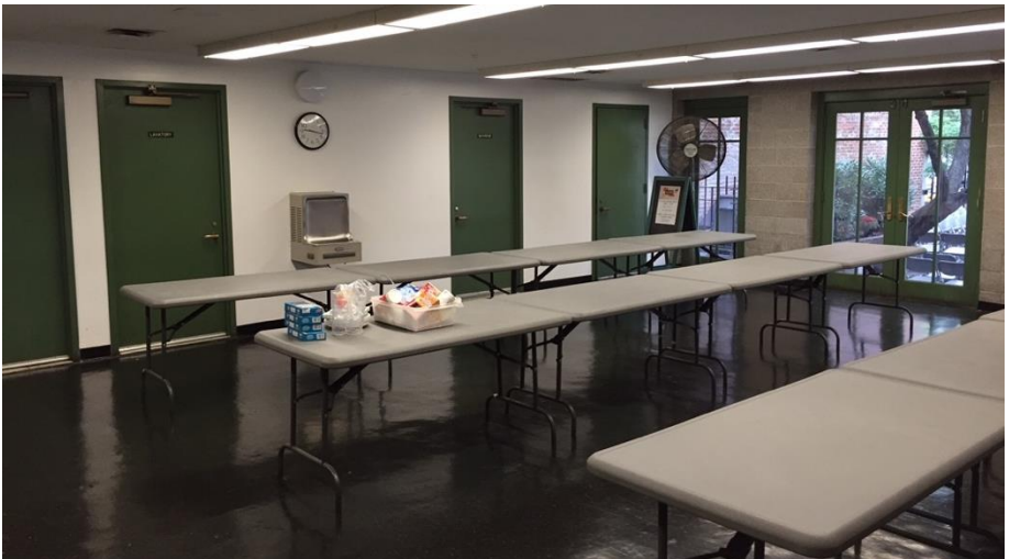
Our First Floor Community Room where we operate our soup kitchen, and where the restroom/shower is located.

Some groups have independently made contact with outer borough churches or schools that have parking lots and have stored their vehicles there and then taken a train into the city.