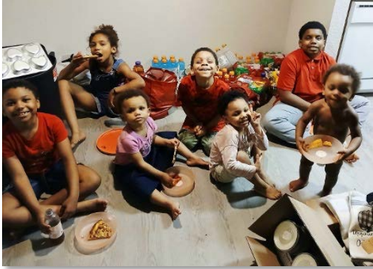
Auriona's kiddos having a pizza party on their first night in their new apartment