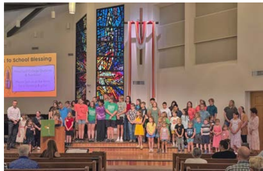
Thanks for joining us for Fall Launch Sunday at 8:00 & 10:30 (pictured)!

Thank you all for a wonderful Fall Class Launch! On August 3 rd , we had a record-breaking 68 people come forward during worship for a Back-to-School blessing, 10 at 8:00 worship and 58 at 10:30! We loved praying over you all, and we hope that you continue to have a wonderful school year!