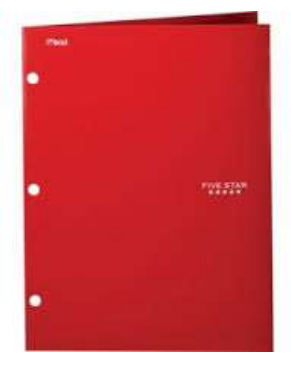
take home folder