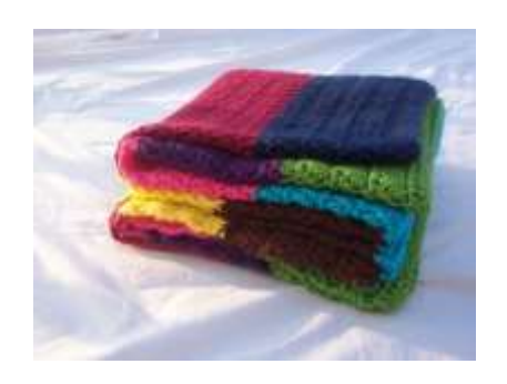
blanket for rest time