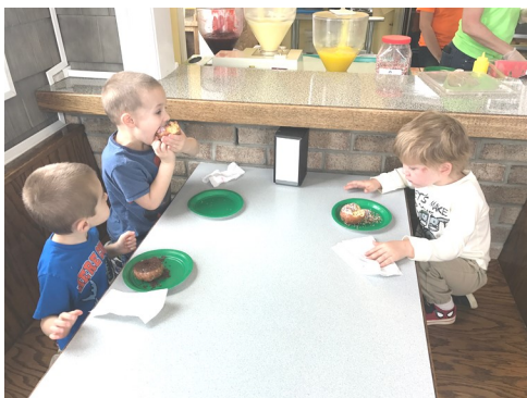
First Children's Homeschool outing to Southern Maid Donuts.