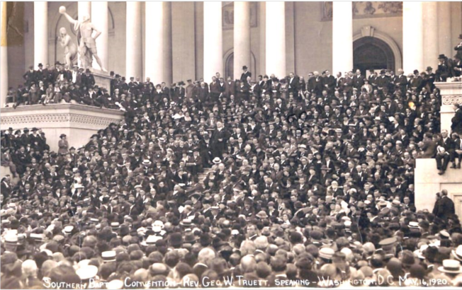
George W. Truett addresses messengers to the convention in Washington D.C.

JEFFERSON CITY, Mo. — Southern Baptists have been Missionary minded since their first day and their first action. When 293 delegates gathered in 1845 in Augusta, Georgia, for the inaugural meeting of the convention, their first resolution expressed the desire to “organize a convention for the propagation of the gospel.” Before leaving Augusta, they had formed Foreign and Domestic Mission Boards, and appointed presidents to lead these efforts. These entities were the new Southern Baptist Convention’s (SBC) priority, and they remain so to this day.