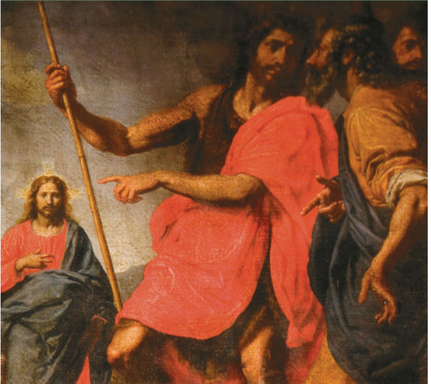
Marco Basaiti: Calling of the sons of Zebedee, 1515