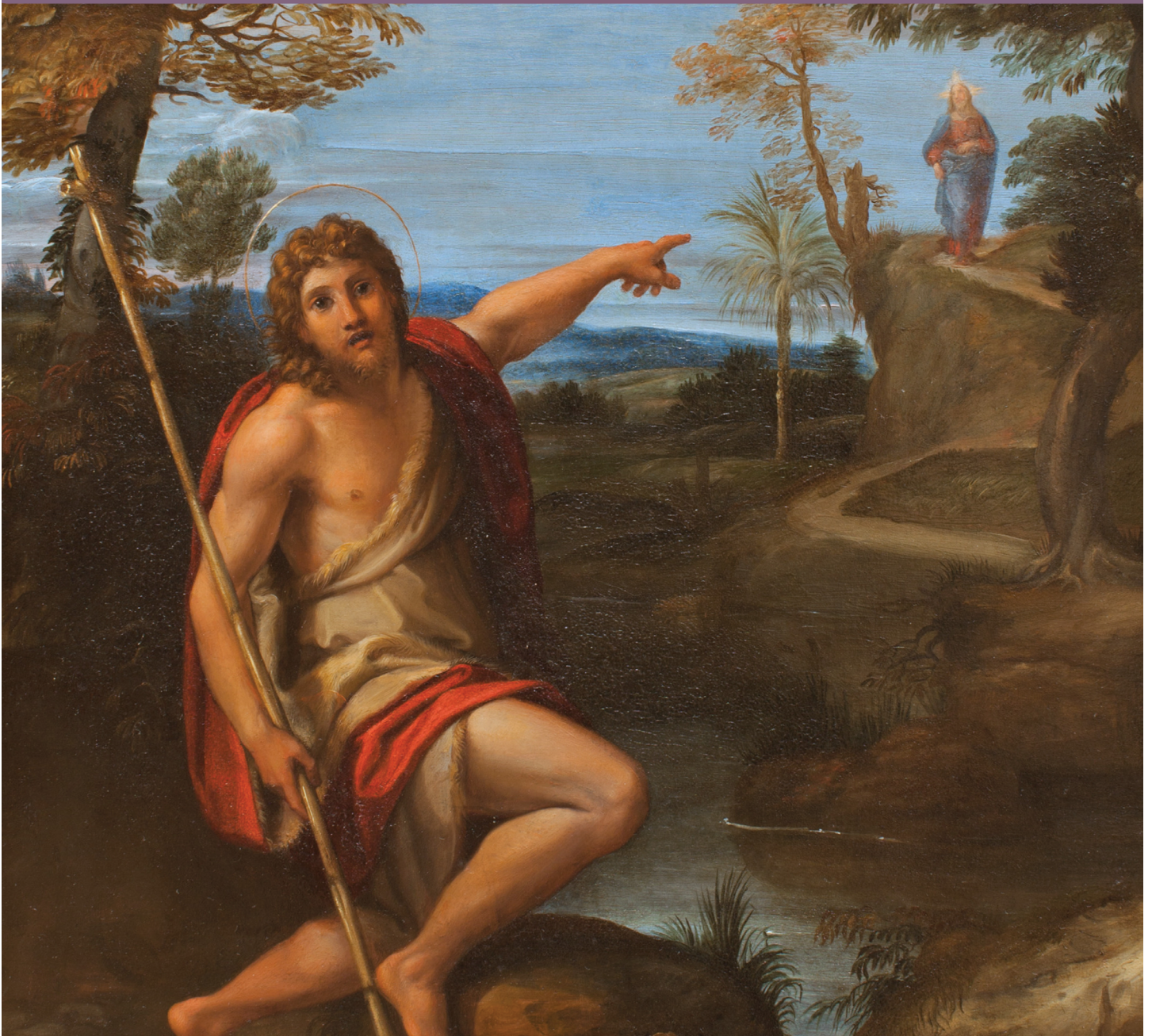
Annibale Carracci: Saint John the Baptist Bearing Witness, Circa 1600