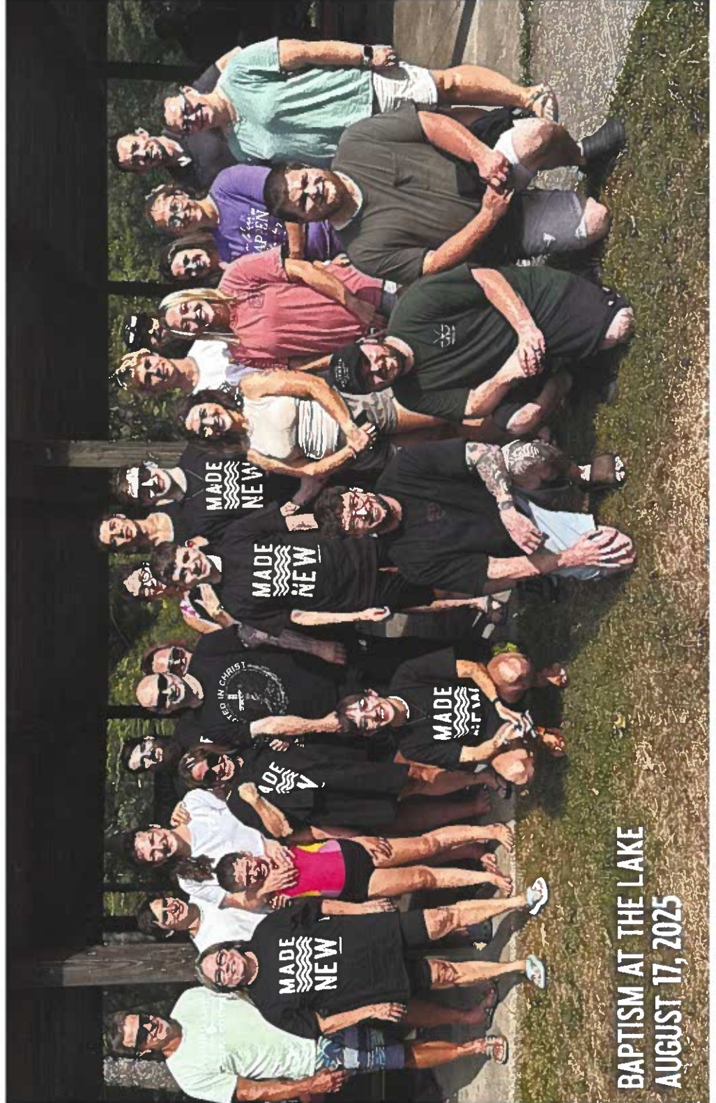
BAPTISM AT THE LAKE AUGUST 17, 2025