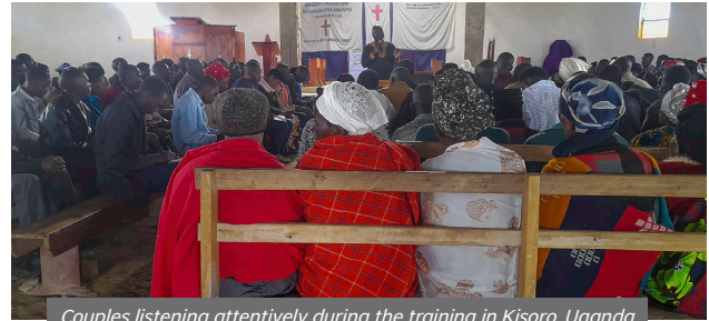
Couples listening attentively during the training in Kisoro, Uganda