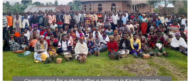
Couples pose for a photo after a training in Kisoro, Uganda